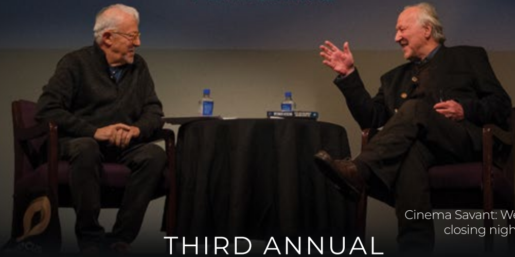
Cinema Savant: Werner Herzog closing night event, 2023