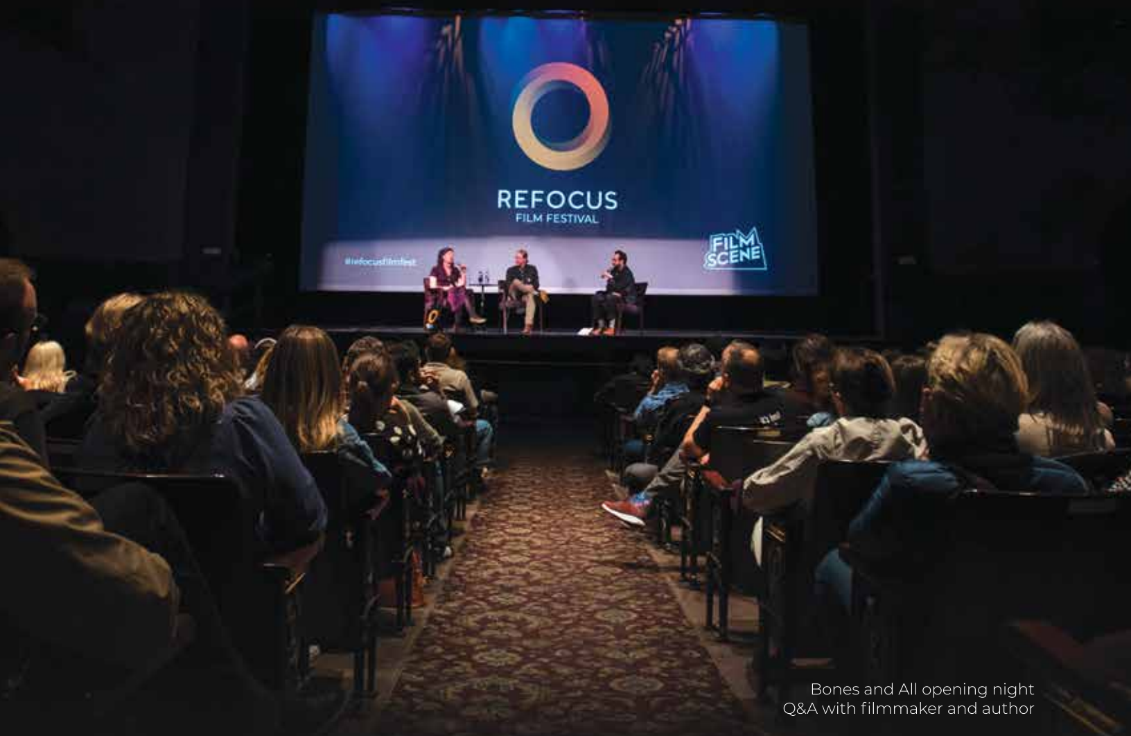
Bones and All opening night Q&A with filmmaker and author